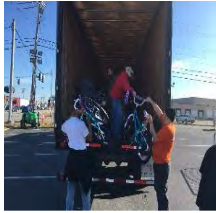
UAW Local 3058 member Chris Ash helping to build bikes. Volunteers from all over. Pictures of bikes loading into trucks, are with the support of UAW Local 862 at their Local Union Hall.