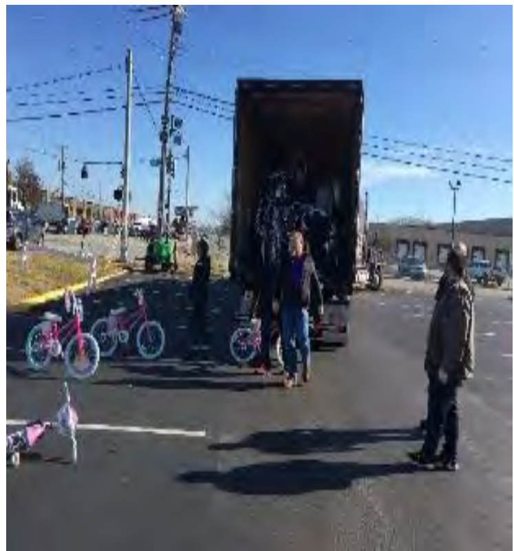
WOW! So many bikes for kids this year. Truck is getting full. A good thing.